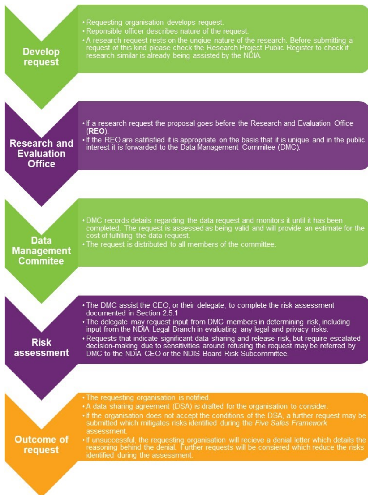
FIGURE 2: THE TAILORED DATA REQUEST ASSESSMENT PROCESS

If you would like to provide feedback on the NDIA Data Sharing procedure, you can do so at the website. ndis.gov.au