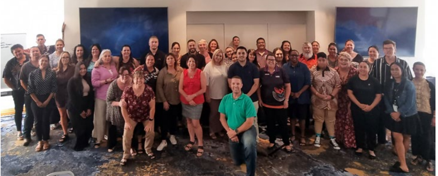
First Nations staff at the First Nations Employee Network (FNEN) conference, November 2022