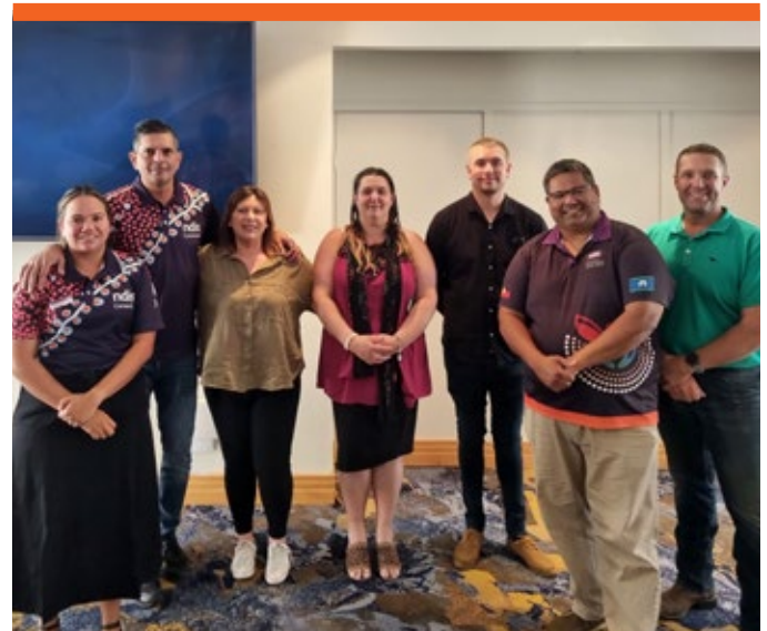
First Nations Employee Network Committee members